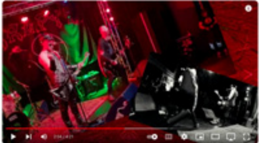
Punk n' Roll and Rock You, live at Lygten Station, Copenhagen, September 16th, 2023.