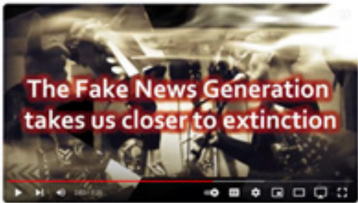
Fake News Generation, pre-production recording in the Vulture Nest, June 28th, 2023.